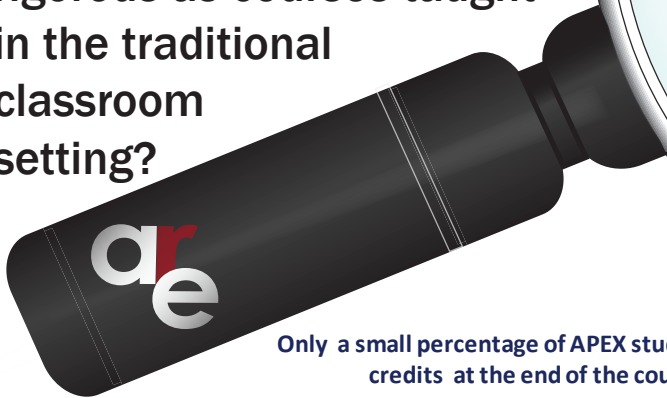
Only a small percentage of APEX students earned credits at the end of the courses.

Are APEX courses as rigorous as courses taught in the traditional classroom setting?